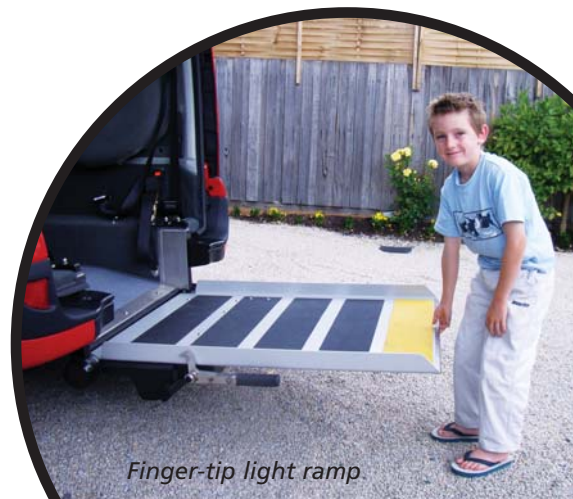
Finger-tip light ramp